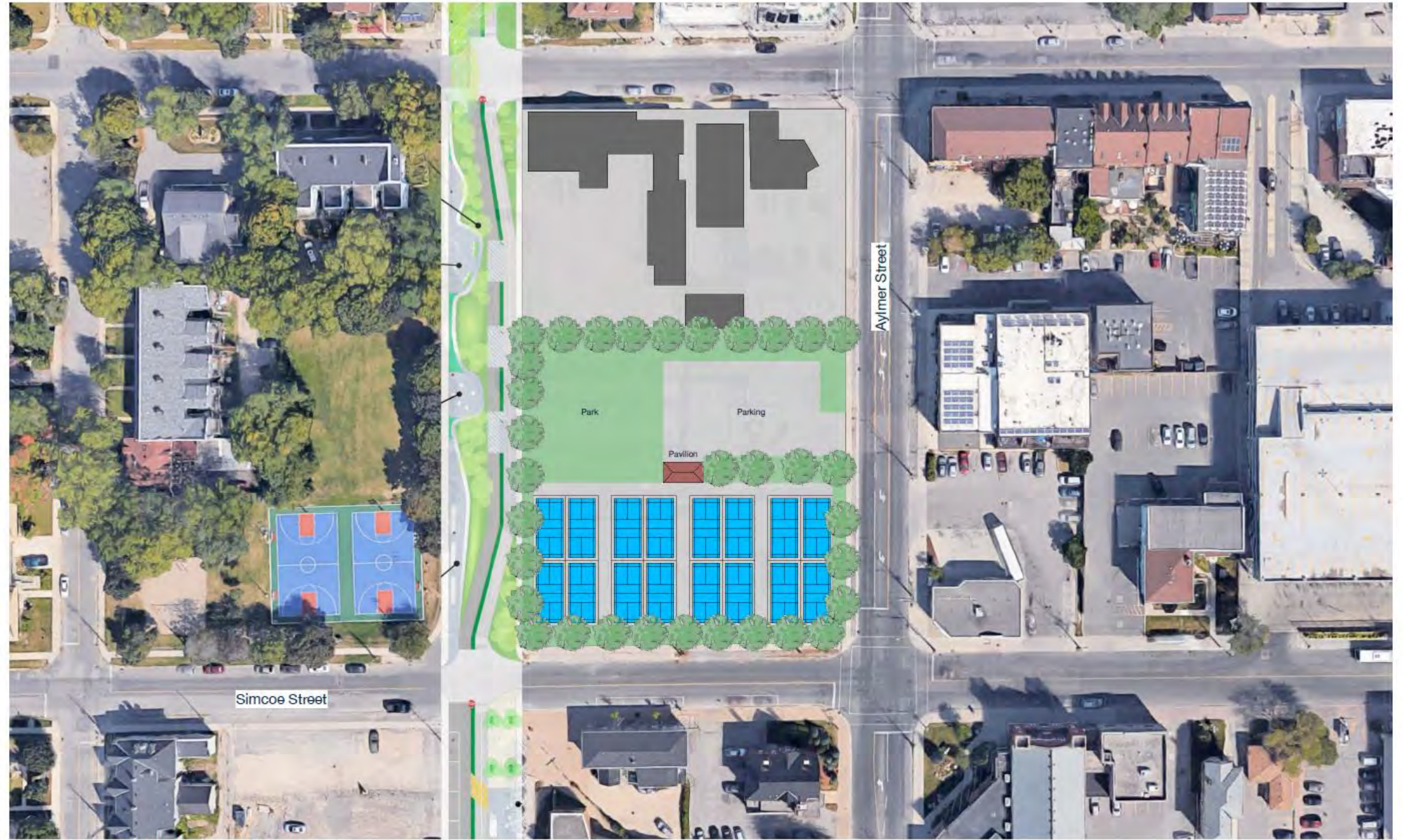
Downtown Pickleball Park Concept Peterborough + Kawarthas Chamber of Commerce